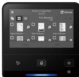
5-inch colour touch panel

When using Private Charge Print, you can easily select and delete the documents viewing the thumbnails shown on the panel. Convenient for saving time and waste.