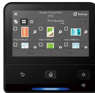
5-inch colour touch panel